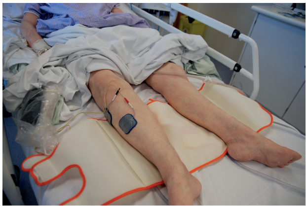
Fig. 2. Electrode position for electrical stimulation of the peroneal nerve for increased blood flow to the lower limb (posed with a mannequin).

NMES has been approved by NICE as an alternative prophylaxis when other mechanical and pharmacological methods of prophylaxis are impractical or contraindicated (47, 48). The transcutaneous application of electrical impulses stimulates the common peroneal nerve to generate dorsiflexion in the lower limb, which, in turn, activates the calf muscle pump, emulating the normal physiological response achieved by walking, without the patient having to mobilize. Electrode positioning is demonstrated in Fig. 2. NMES has been shown to